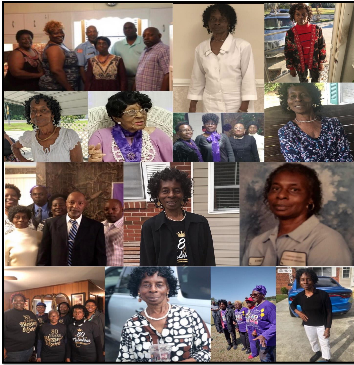
Come With Me

God saw you getting tired and a cure was not to be, so he put his arms around you and whispered, come with me. With tearful eyes we watched you decline and saw you fade away, Although we loved you dearly, we could not make you stay. A golden heart stop beating, hardworking hands at rest, God broke our hearts to prove to us, He only takes the best.