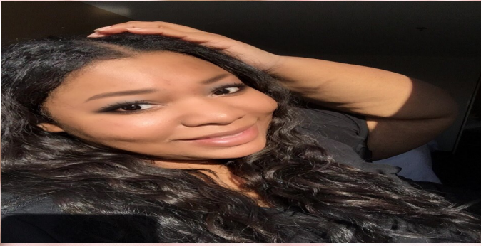
Honorable Judge Bettie AnnJoyce Buchanan October.11.1980 - March.23.2019